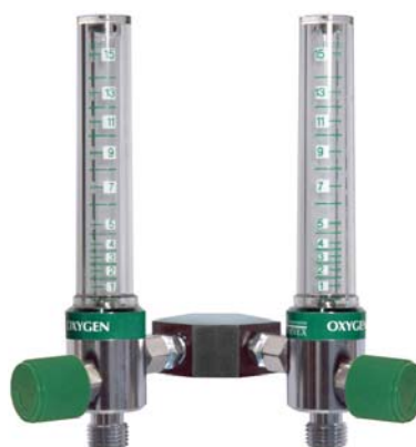
Dual Flowmeter Assembly