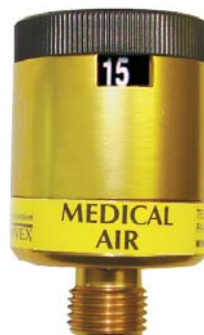
Medical Air Dial Flowmeter